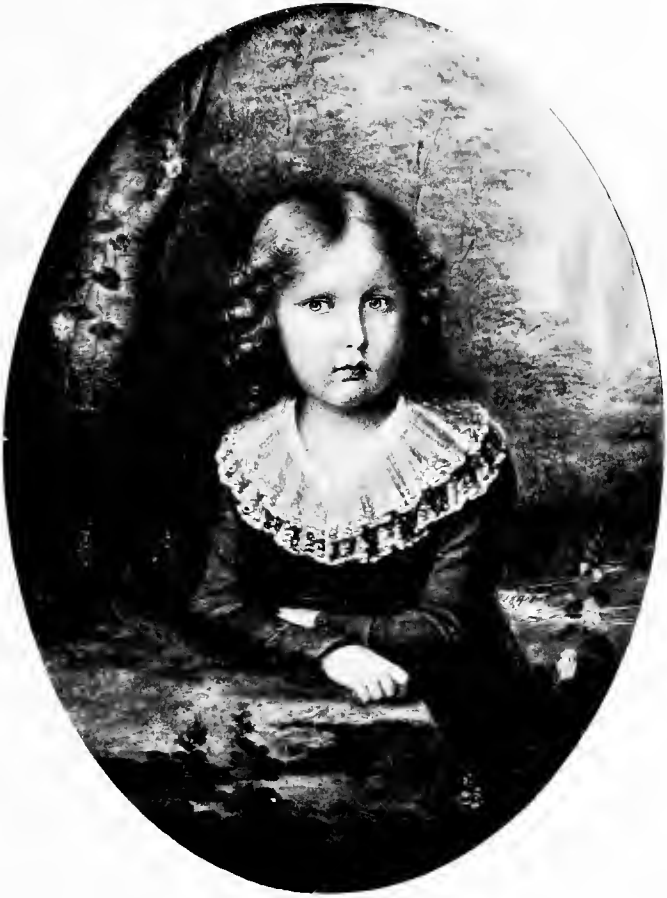
THE PRINCE OF PARMA From a miniature by Natale von Schiavoni In the Collection of the Emperor Francis Joseph I